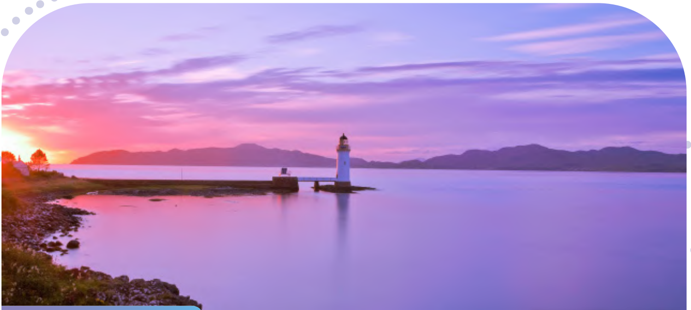
Tobermory Lighthouse, Isle of Mull