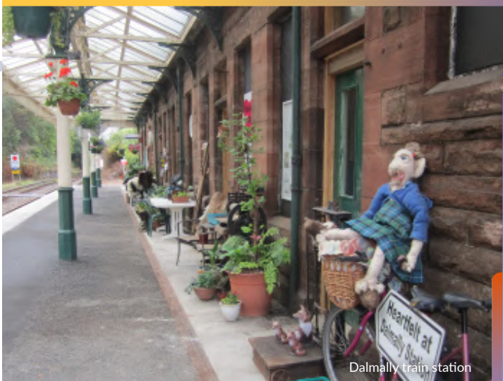
Dalmally train station