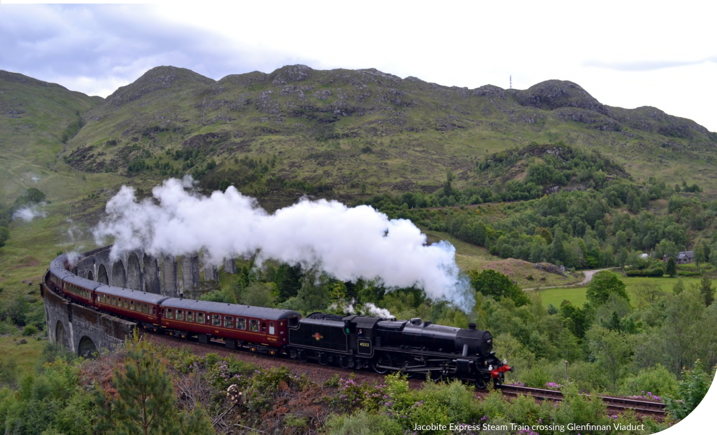
Jacobite Express Steam Train crossing Glenfinnan Viaduct

Enjoy one of Scotland's most iconic rail journeys with a trip on the Jacobite Steam Train