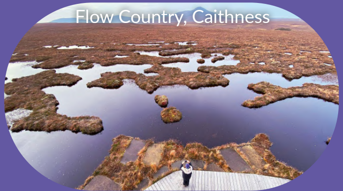
Flow Country, Caithness