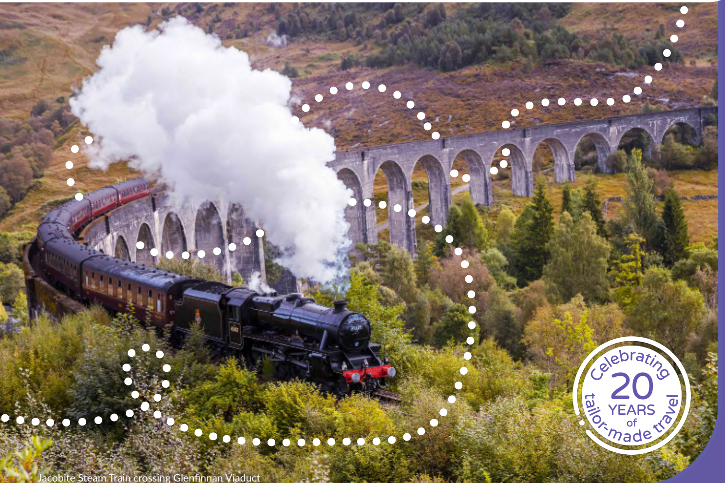
Jacobite Steam Train crossing Glenfinnan Viaduct