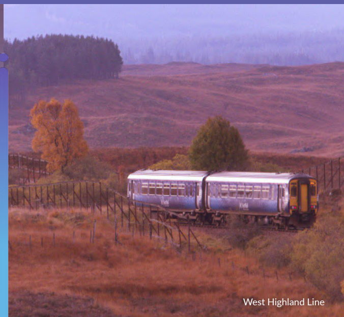
West Highland Line