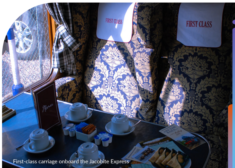
First-class carriage onboard the Jacobite Express