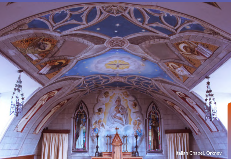
Italian Chapel, Orkney